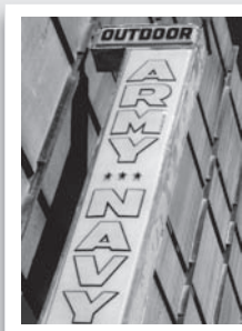
Outdoor Army Navy – 47 East State Since 1947 Harmon Lustig