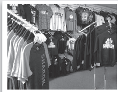
Cazzco Printing – 1020 East State Brian Caiazzo