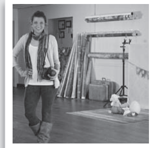
Emily Rose Photography 157 East State – Emily LaBruzzo

And here's to the "old guard," tried and true, who have withstood the test of time!