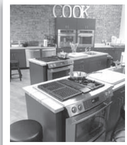
Thyme in Your Kitchen – 79 East State Pat Evans