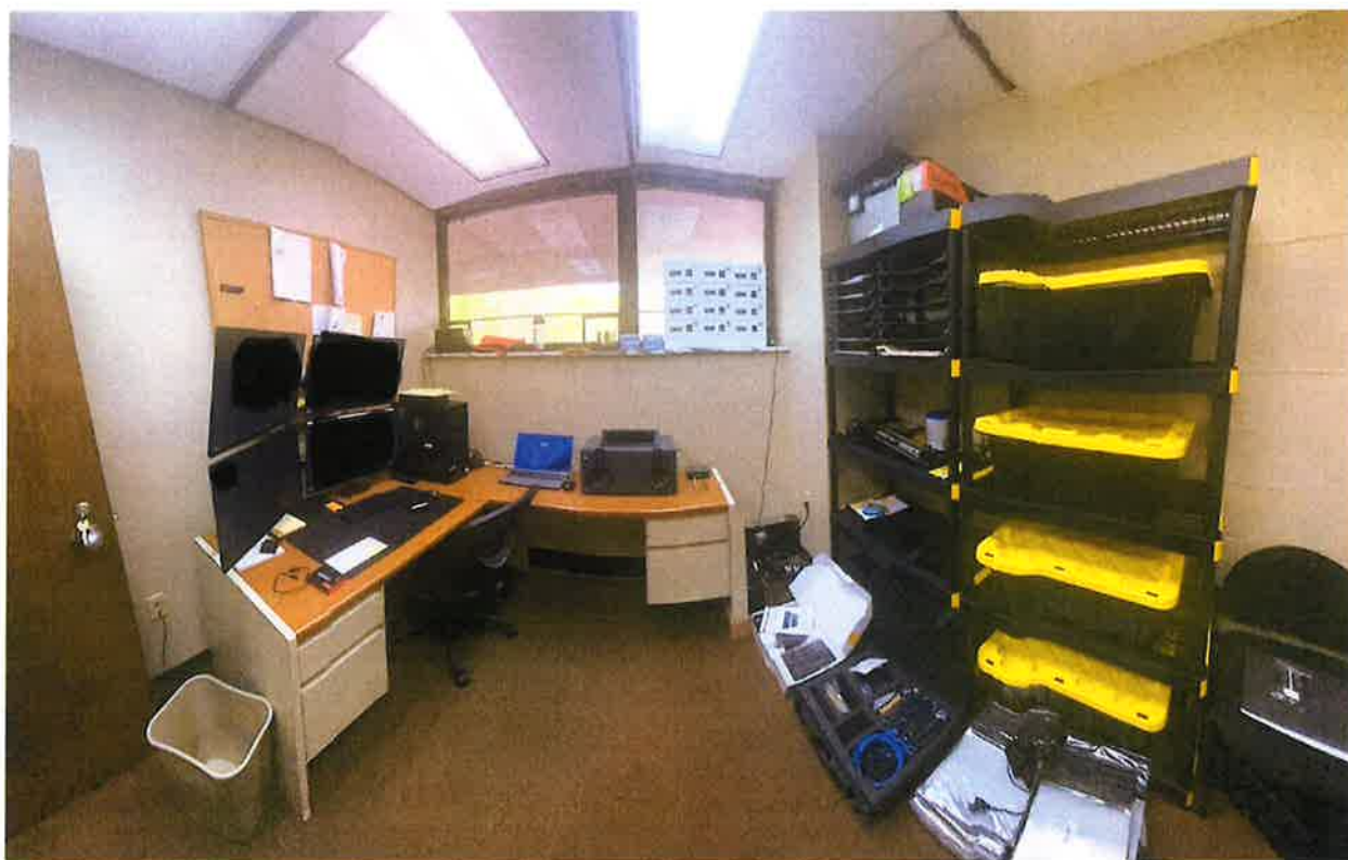
Digital Forensics Lab

Additionally, through grant and donation funding the Digital Forensics program has been upgraded with newer equipment and new analysis software, that allows for storage capacity and proper function of the software.