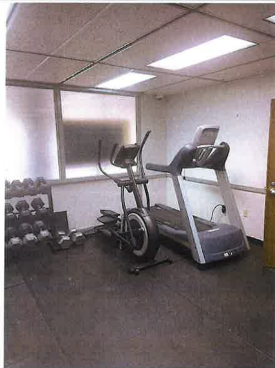
SPD Gym Facility